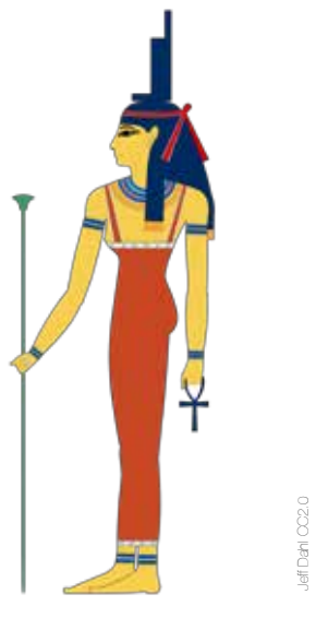
In the stories and myths Isis, the Egyptian goddess, gathered what had been shattered and breathed new life into it.

If you have a suggestion for an inspired, powerful new name, please let us know: isisphotos@vahoo.com